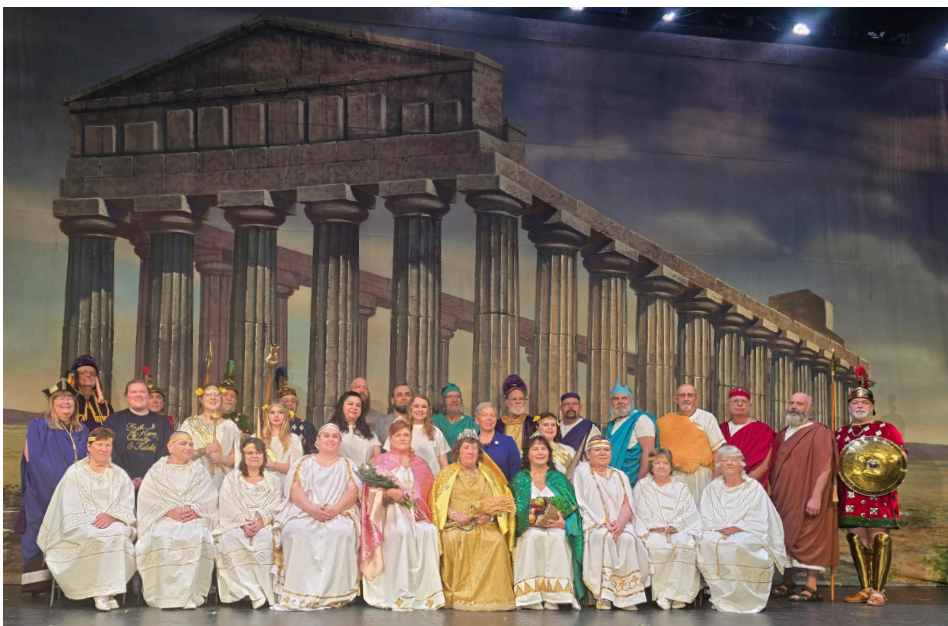
The cast members assembled for the recording of the Grange's 7th Degree, in the historic costumes and in front of one of the large hand-painted backdrops.