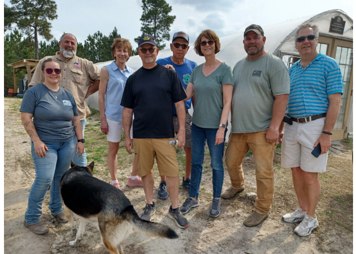
Cape Fear Grange members with the VFNC team.