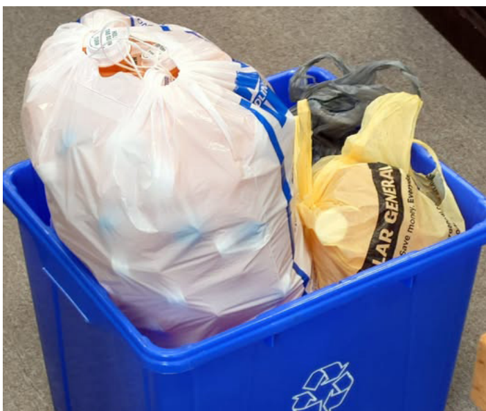
308 pill bottles were collected from the town office in this pickup, from December 2024.