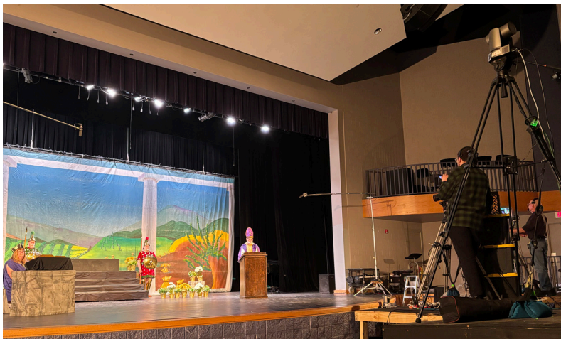
Filming in progress: The film crew (at right) worked hard to capture several angles and takes of each scene for optimal preservation and record.