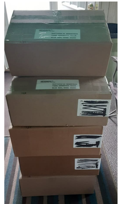
The April 2025 shipment, ready to head to the post office. April was Interlaken Grange's busiest collection month to date - with 1,215 bottles.

Help us help others —one pill bottle at a time.