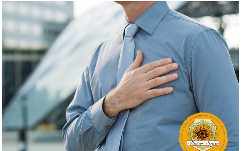
Lecturer, Third Degree

AN HONEST MAN IS THE NOBLEST WORK OF GOD.