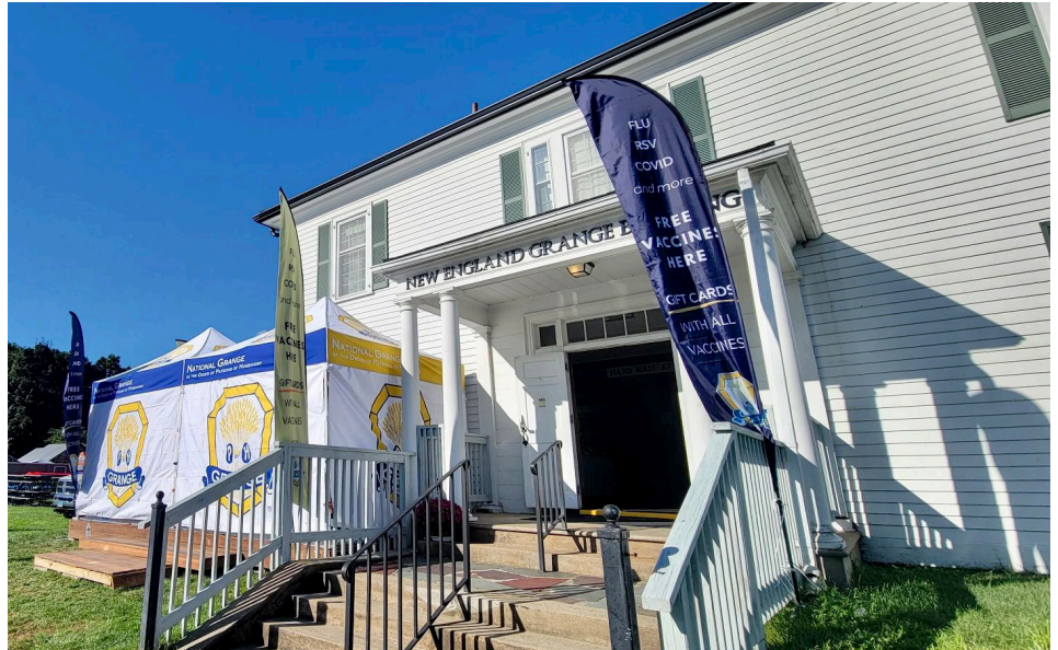
The vaccination booth set up outside of the New England Grange Building at the Big E in 2023. More than 3,500 vaccinations were administered in 2023, and the National Grange is aiming even higher in 2024. Photo submitted

"We were so pleased to be a part of the vaccine outreach at last year's Big E and even happier