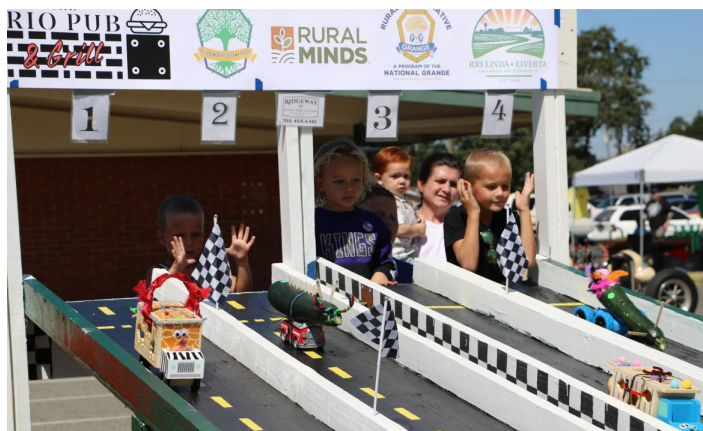
Children from around the Rio Linda area entered a variety of decorated and wheeled zucchinis in the races.