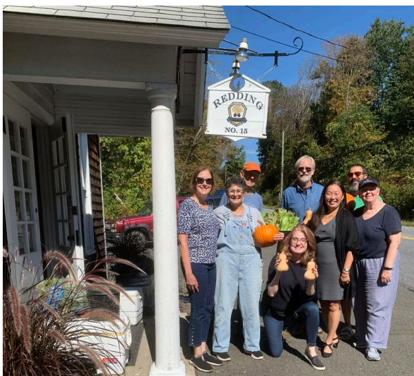
Some of Redding Grange's volunteers at the 2023 food rescue program.