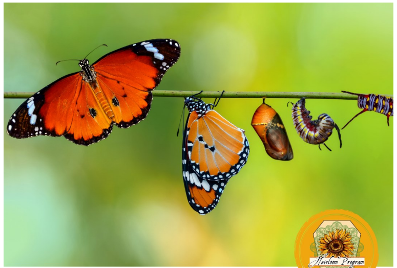
Second Degree, Ceres