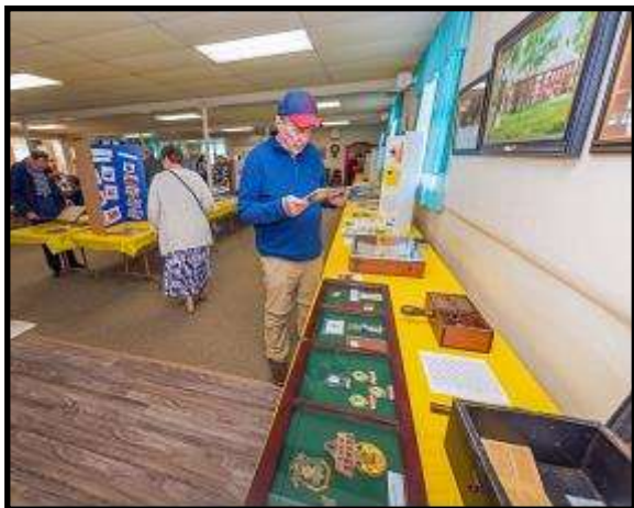
Grange Items from 19th and 20th Century