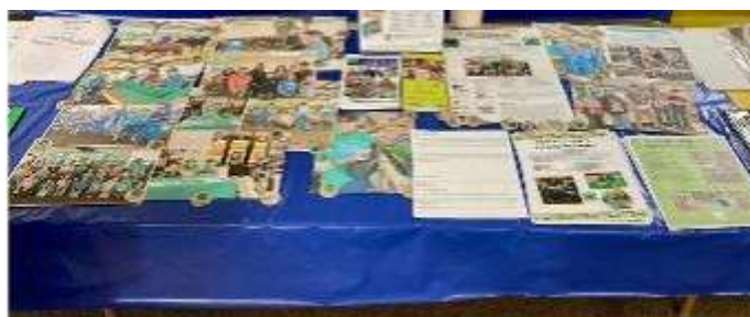
Turkey Hill Sponsors the Busy Bees 4H Club.