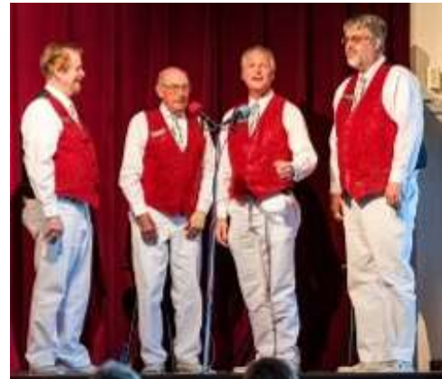
Rivertown Singers entertained between acts