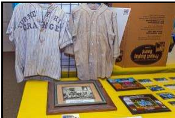
Grange had a baseball team in the 1920s; now we sponsor t-ball teams