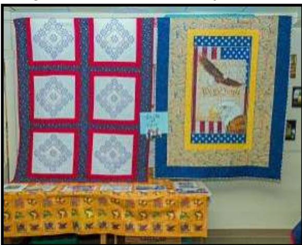
Quilting Team makes Quilts of Valor yearly.