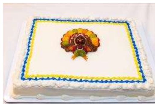
The Banquet concluded with cake and ice cream