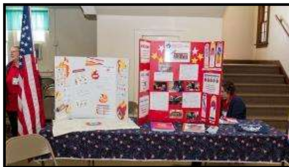
Turkey Hill sponsors American Heritage Girls Troop 1370