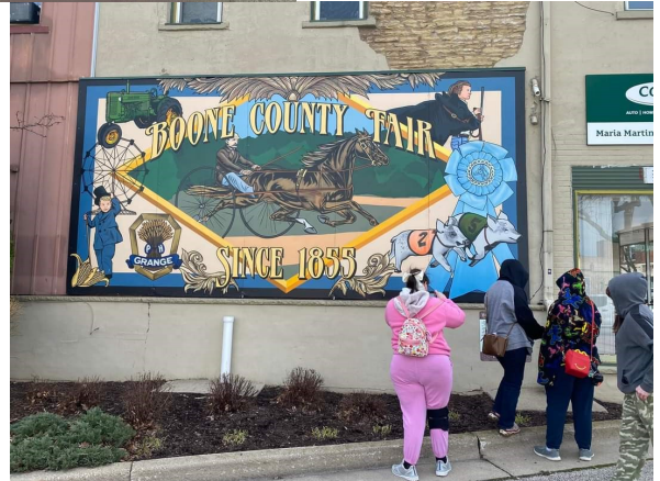
Cleaning up on our walk