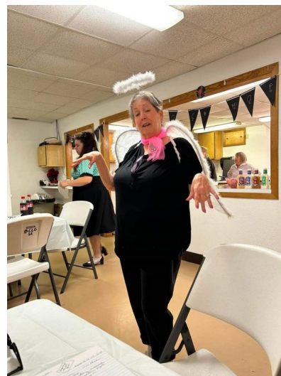
Guess who died during the Murder Mystery Dinner?????