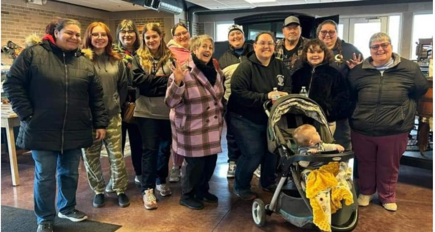
Spring Fling participants from northern Illinois at the Museum.