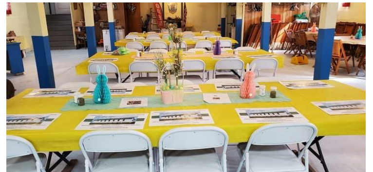
Lastly, our Grange held a spaghetti dinner on March 23. Donations from Grangers and friends were given to help a Granger with medical needs.